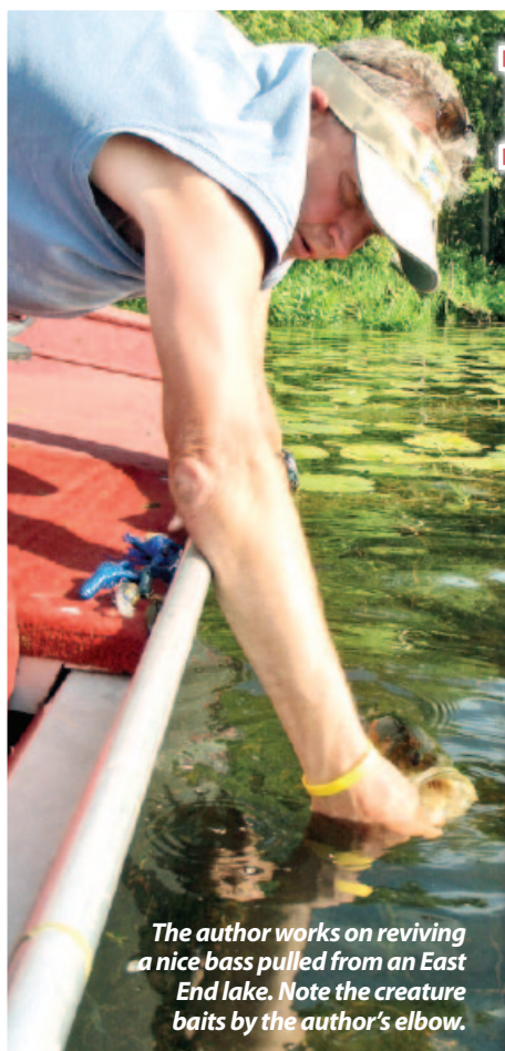
The author works on reviving a nice bass pulled from an East End lake. Note the creature baits by the author's elbow.