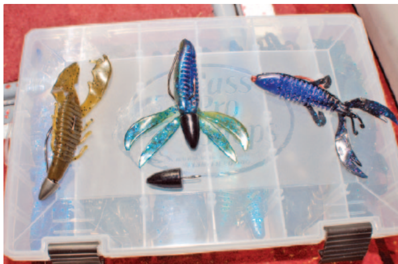
Left to right: Typical Texas Rig, followed by a Lake Okeechobee or Reverse Texas rig (notice the weight is at the bottom, rather than near the hook eye) and the weedless rig with no weight – great for topwater action.

A s Long Island's freshwater bass season gets underway, local lakes and ponds on Long Island begin to get cluttered with milfoil, hydrilla and lily pads. However, the one benefit of all this plant life is its ability to attract some of the largest bass in a body of water. Anglers on Long Island can catch fish using topwater lures like Dean Rojas SPRO Frogs, Heddon Zara Spooks, Strike King jigs tipped with Zoom trailers or they can opt for one of the many "creature" baits on the market today. Creature baits can best be defined as soft plastic frog/lizard type baits on steroids. They have multiple appendages that can be modified on some, are sleek, making the penetration of thick cover easy, and come in every color of the spectrum.